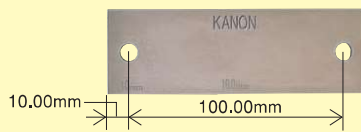
Initial setting gauge block